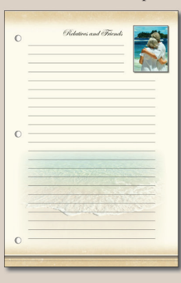
Examples of Themed Pages